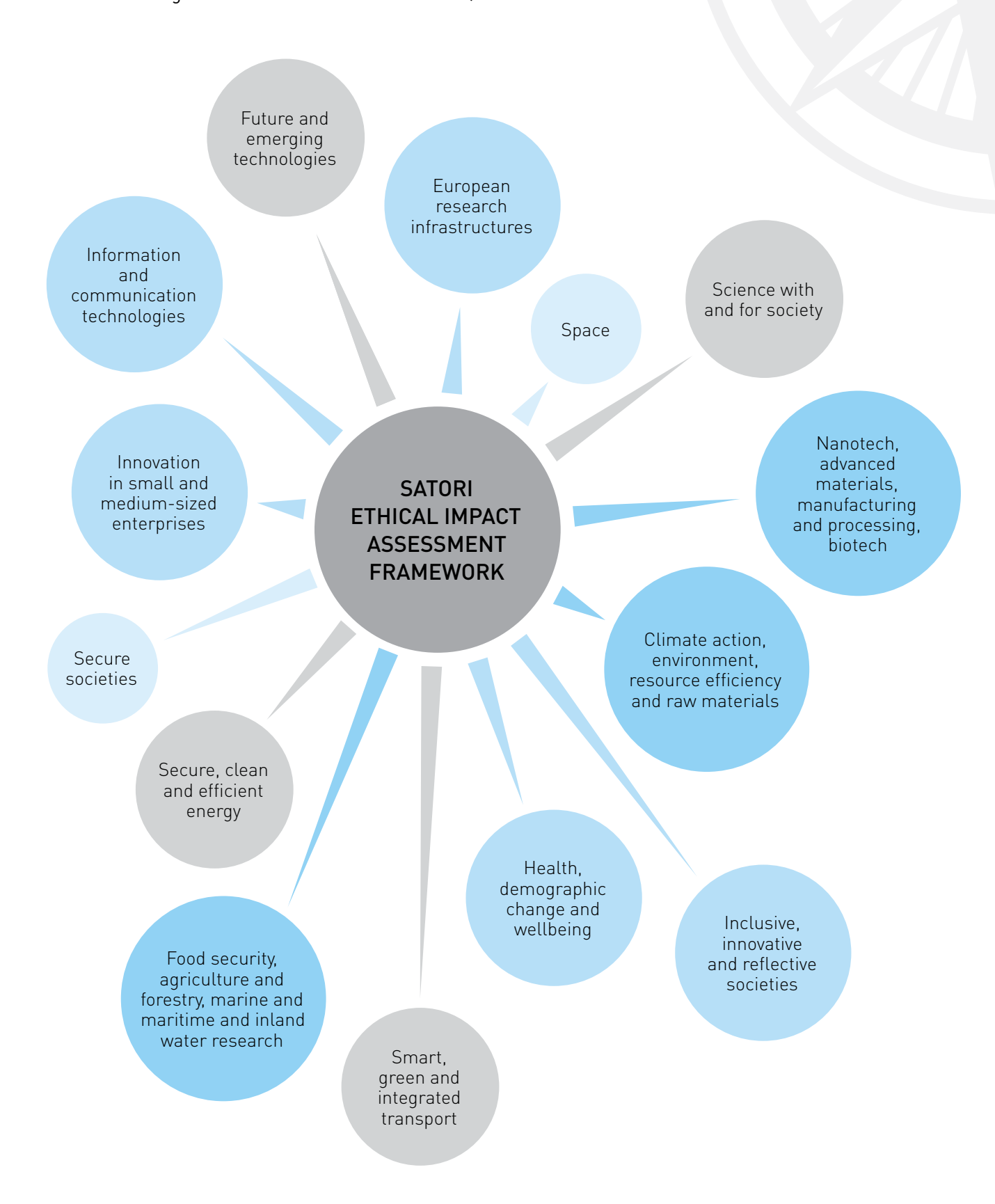
Figure 1: Areas of potential use for the SATORI EIA (based on Horizon 2020 EU Framework Programme for Research and Innovation)