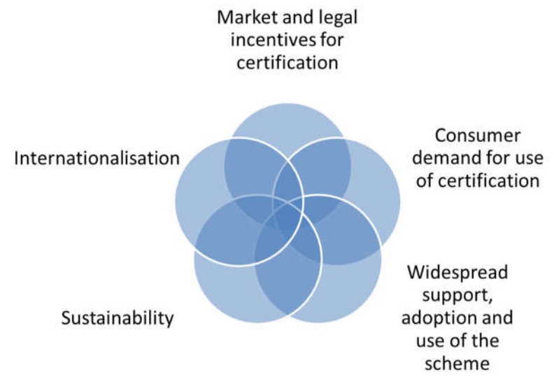
Fig 2: Some success factors of ISO certification standards

The analysis of the certification standards highlights the following key success factors for the analysed certification standards.