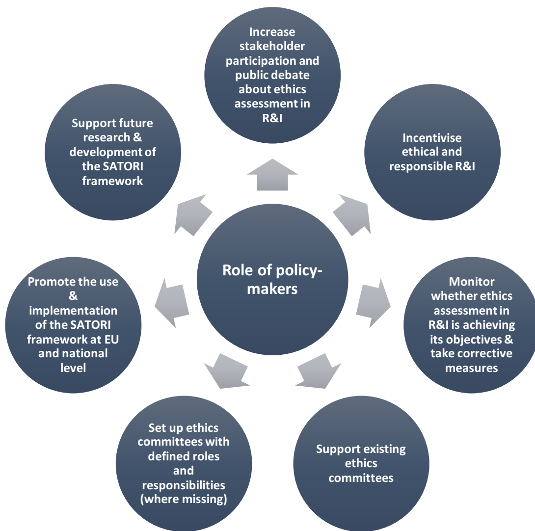
Fig: Role of policy-makers in supporting ethical R&I

There are various types of policy actors influential in ethics of R&I at the global level e.g., Council for International Organizations of Medical Sciences (CIOMS), Organisation for Economic Co-operation and Development (OECD), United Nations (UN), UNESCO, World Health Organization (WHO). The institutions often have specific committees or commissions dedicated to ethics.