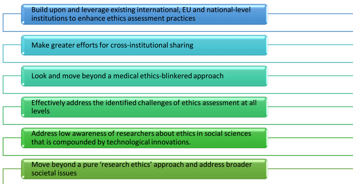
Fig: SATORI key take-away messages for policy-makers

The report has also identified a significant number of opportunities for intervention at the national level. All these require further funding, support and encouragement by policy-makers at the EU and national level. To add to this, countries face various challenges in the use and implementation of ethics assessment. These too need to be considered and addressed through dialogue, resource allocation and good practice sharing across countries (potentially supported by an EU-level institution, if deemed appropriate). Additional key take-away messages for policy-makers based on the work underpinning this report and the SATORI policy workshop discussion, include the need to: